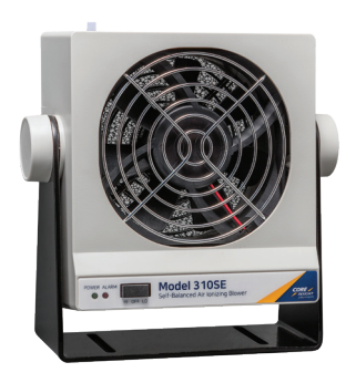
Model 310SE or Model 310S Ionizing Blower